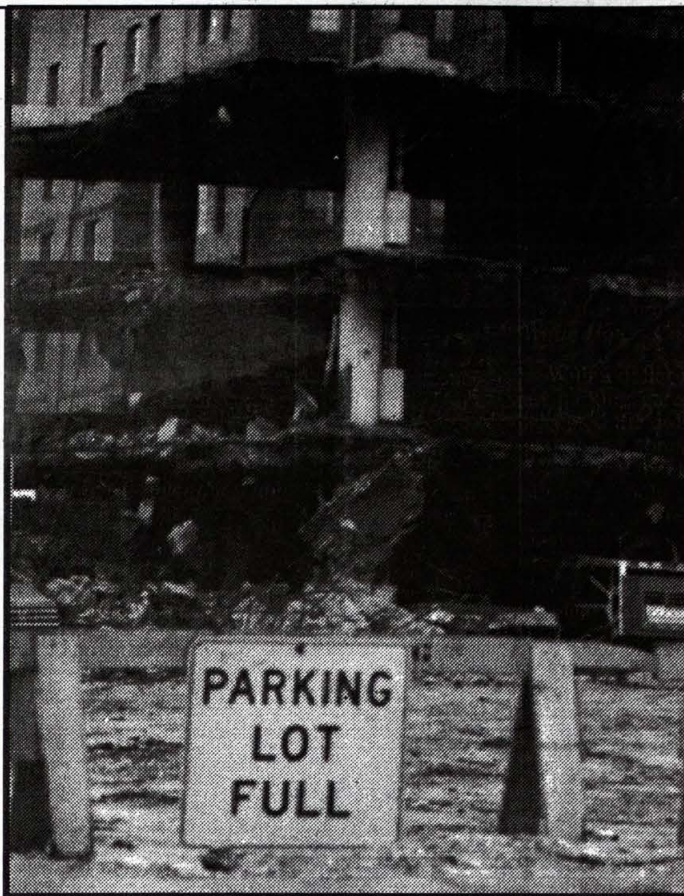
New state-of-the-art parking center would have 4,000 spaces and a pool.

And for you incoming Interns, remember, it's not that hard to type with your mouth full.