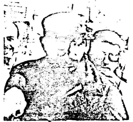
Message of greeting from Fidel Castro, Prime Minister of Cuba, to the World Congress for International Women's Year.

On behalf of the people, the Communist Party and the Revolutionary Government of Cuba I convey to you, the delegates of the World Congress for International Women's Year held in Berlin, the capital of the German Democratic Republic, sincere revolutionary greetings.