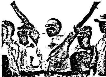
Agostinho Neto, President of MPLA

Desiring to end bloodshed and to support the efforts of the Portuguese authorities aimed at creating conditions essential for the proclamation of Angola's independence on November 11, 1975, the MPLA agreed to participate in the transitional government of Angola along with the FNLA and the National Union for Total Independence of Angola (UNITA).