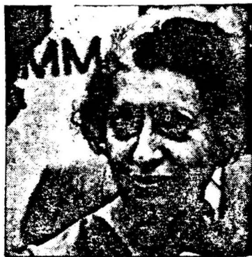
Prime Minister Indira Gandhi

liberation in formerly colonized areas of the World (in Asia, Africa, Central and South America). The national liberation movement is daily gaining momentum. In Laos, Vietnam and Cambodia, the oppressed masses—the forces of history are dramatically scoring great victories over those who want to hold history back—the forces of imperialism and reaction. We witness better prospects in the Middle East where the forces of imperialism and Zionism are beginning to experience the evergrowing power of the Arab peoples, particularly of the Palestinian people derived from the better organization and co-ordination of a just struggle for their usurped national rights.