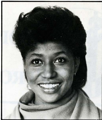
Representative Carol Moseley Braun