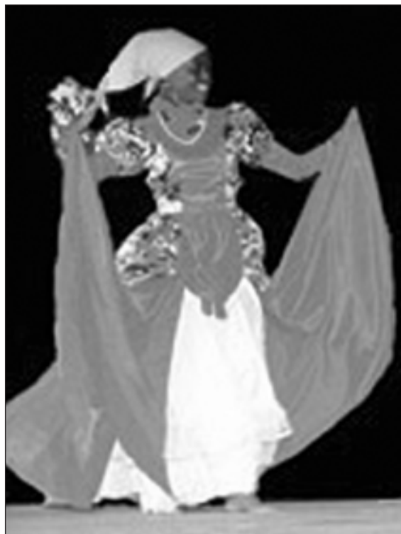
Petticoats and "butterfly" dress for bélè dance in Heritage Festival, Tobago, courtesy of Dayne Job.

Both freed and enslaved Africans—urban and rural dwellers—took a valued cultural item from the dominant group: their imitations of European quadrille dancing. They learned to execute the dance figures with as much aplomb as European performers; in the most extreme case on Martinique, they consciously usurped its European content, changing the dances