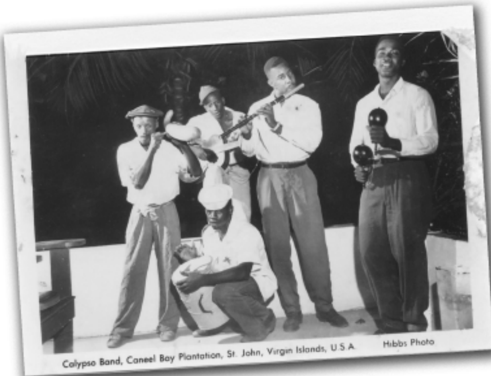
Calypso Band, Caneel Bay Plantation, St. John, Virgin Islands, U S A.