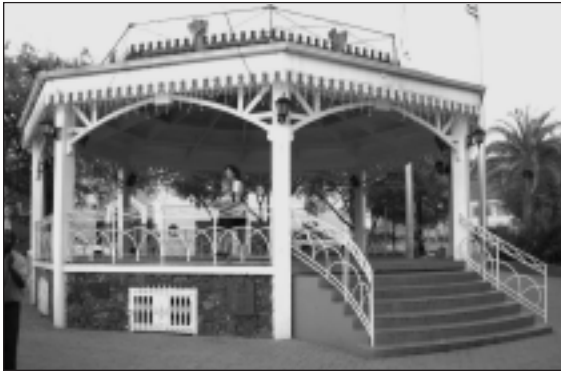
Rehearsals inside gazebo of Emancipation Gardens, St. Thomas

Zoup, zoup, zoup. Compact disc. (Virgin Island quelbe or “scratchband” traditional music.)