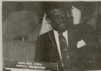
Theo-Ben Gurirab at the UN

Born January 23, 1939 in Usakos , a railway town in Namibia's central western region, Gurirab grew up in a Lutheran household. "My father was a worker", he says simply. He attended a primary German Lutheran